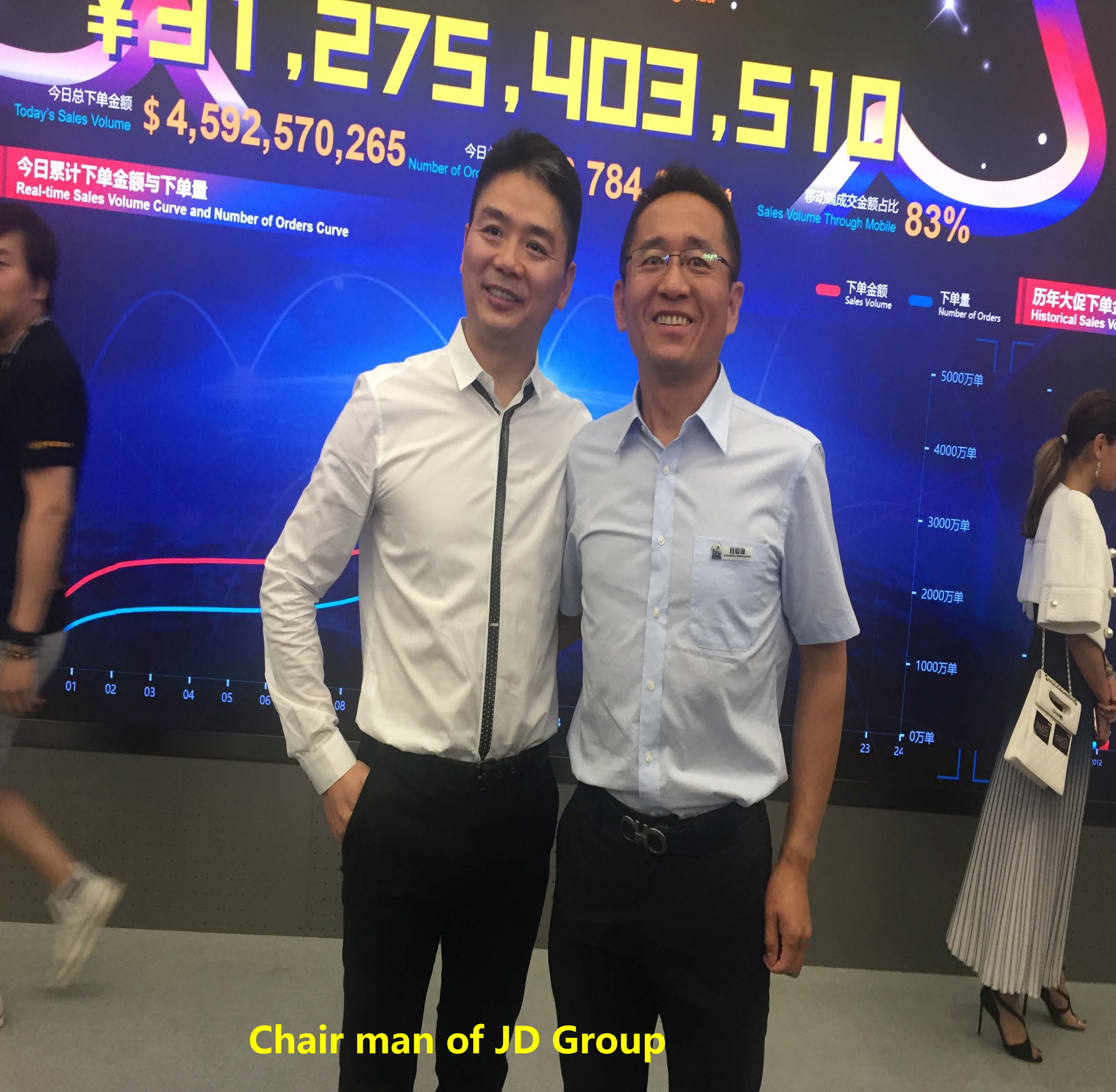
Chair man of JD Group