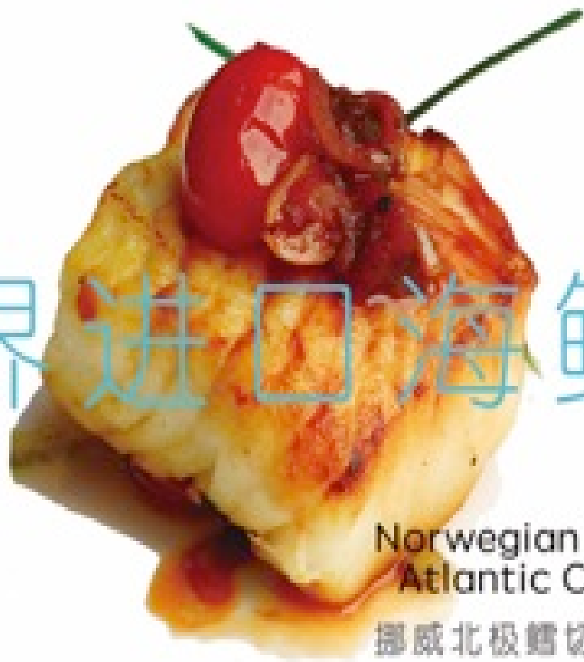
Norwegian Atlantic Cod 挪威北极鳕切块