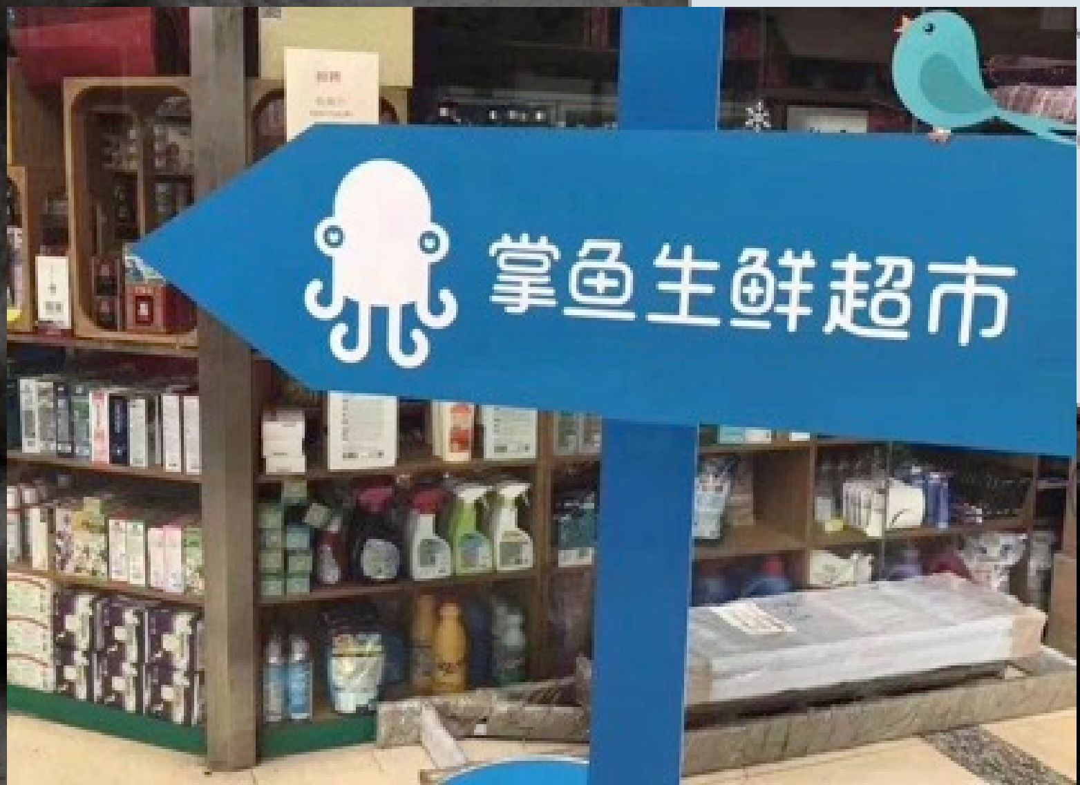
MEITUAN-The biggest online takeout platform