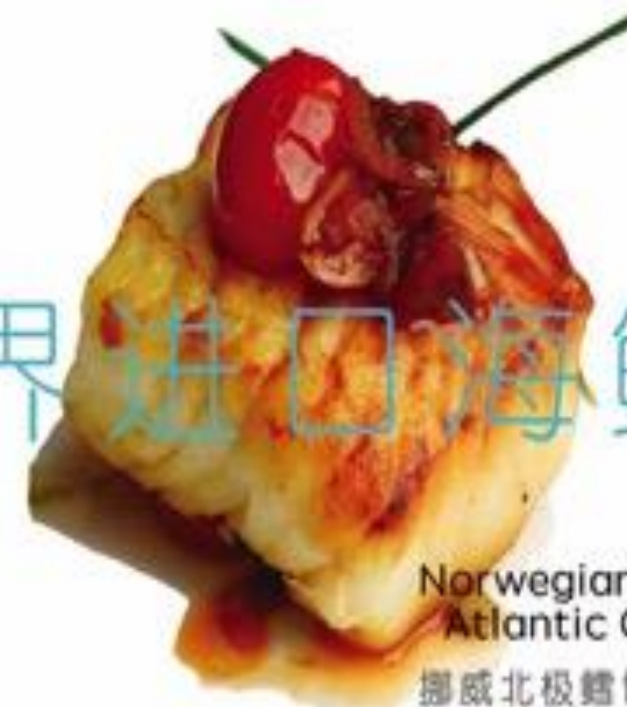
Norwegian Atlantic Cod 挪威北极鳕切块