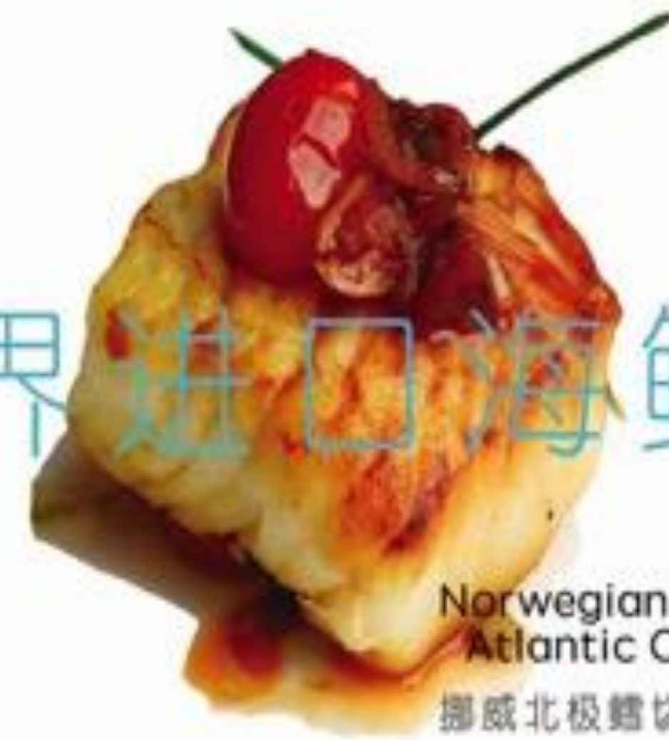
Norwegian Atlantic Cod 挪威北极鳕切块